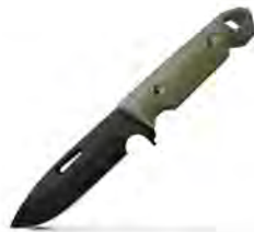
STA Sniper MSRP $205