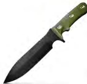
Jungle Fighter MSRP $240