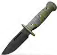
Luke Airman MSRP $240