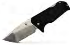
Broadway MSRP $240