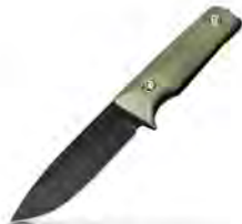
The San MSRP $205