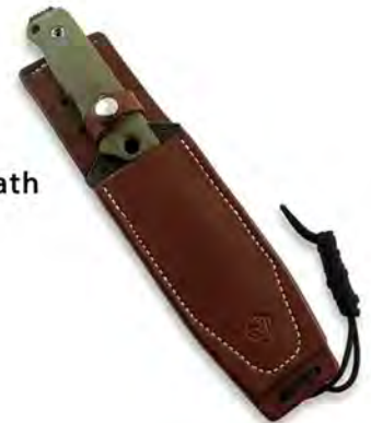
Top-Grain Leather Sheath