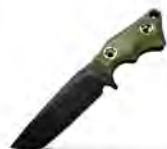
Micro Tanto MSRP $140