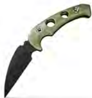
FUK MSRP $190