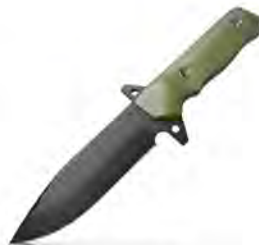
AIO-2 MSRP $235