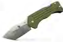
Lombard MSRP $235