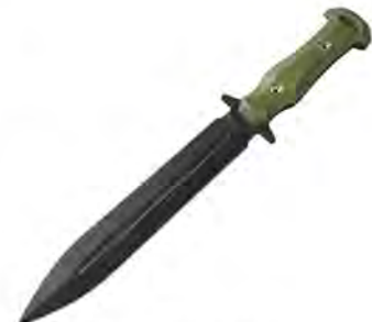
Romulus MSRP $260