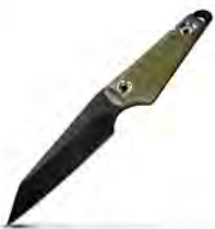
UDT MSRP $155