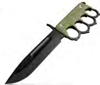
U.S. 2024 MSRP $245