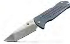
Bourbon MSRP $240