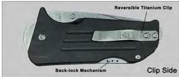
Reversible Titanium Clip