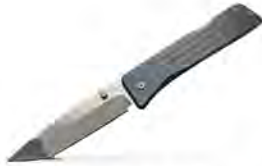
Route66 MSRP $220