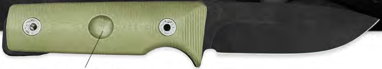
Fire Starting Dimple